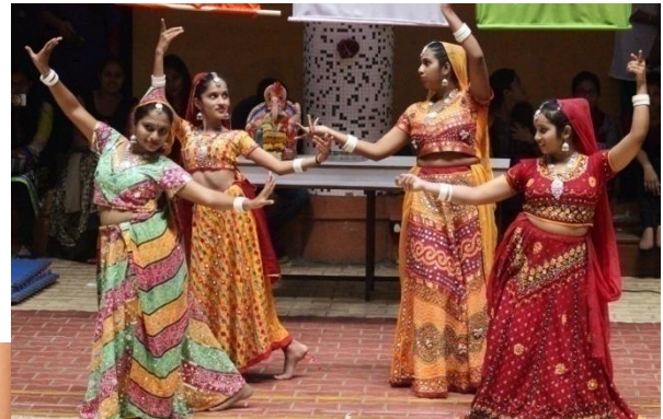
Group of College students performing dance on cultural day