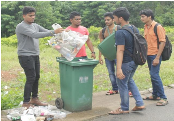
Students throwing plastic items collected from the college campus in the dustbin.