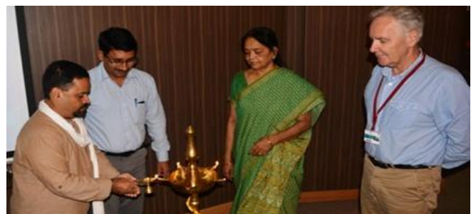
National Level Seminar on "The Writing Centre: An Instrument to Improve the Writing Skills of Students"