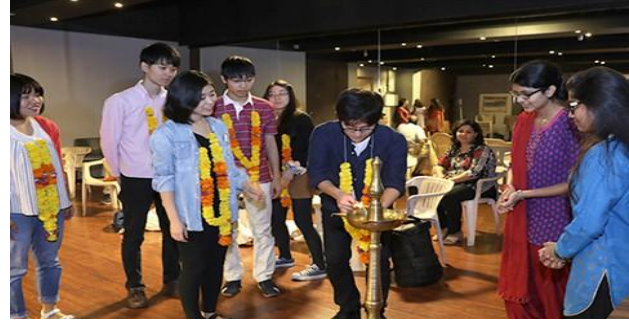
Japanese students lighting the lamp in our college under Student Exchange program.