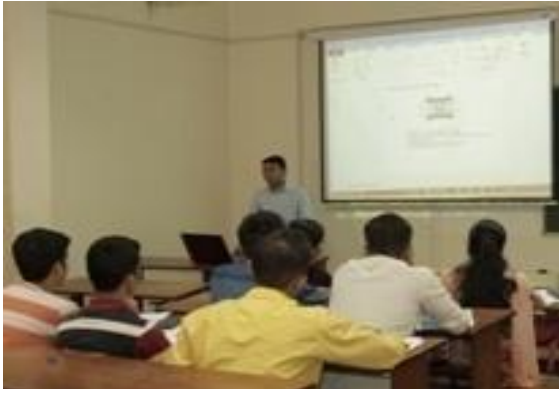
Workshop on “Experimental Physics” for physics students