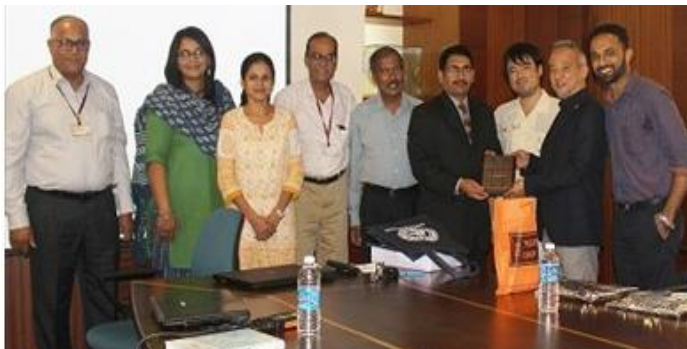
Principal giving memento to the faculty from Kansai University, Osaka, Japan in our College