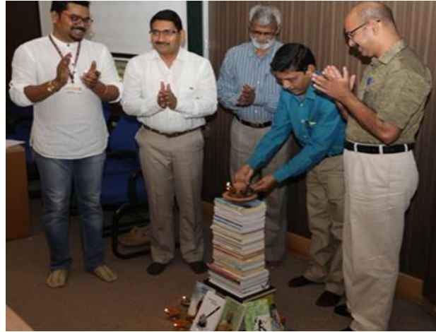
Principal along with Konkani department faculties and Chief Guest is inaugurating at the State Level Seminar on 1 व्याशेकड्यांतले गोंयचें कोंकणी-मराठीसाहित्य: स्वरूपआनीसमिक्षा”