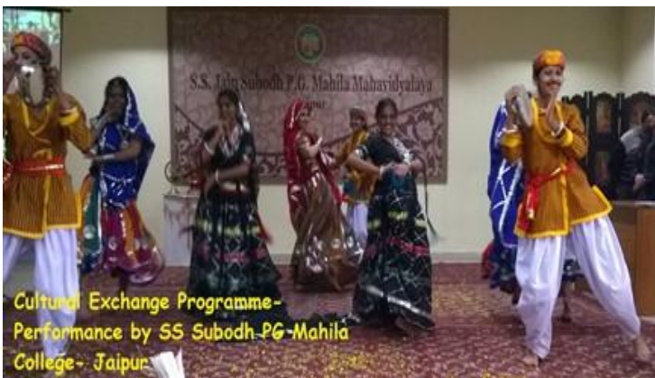
Cultural Exchange Programme - Performance by SS Subodh PG-Mahila College- Jaipur