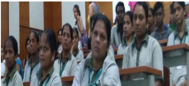
Workshop cum interactive session on "Hygiene and Cleanliness Strategies" for janitors karmacharis